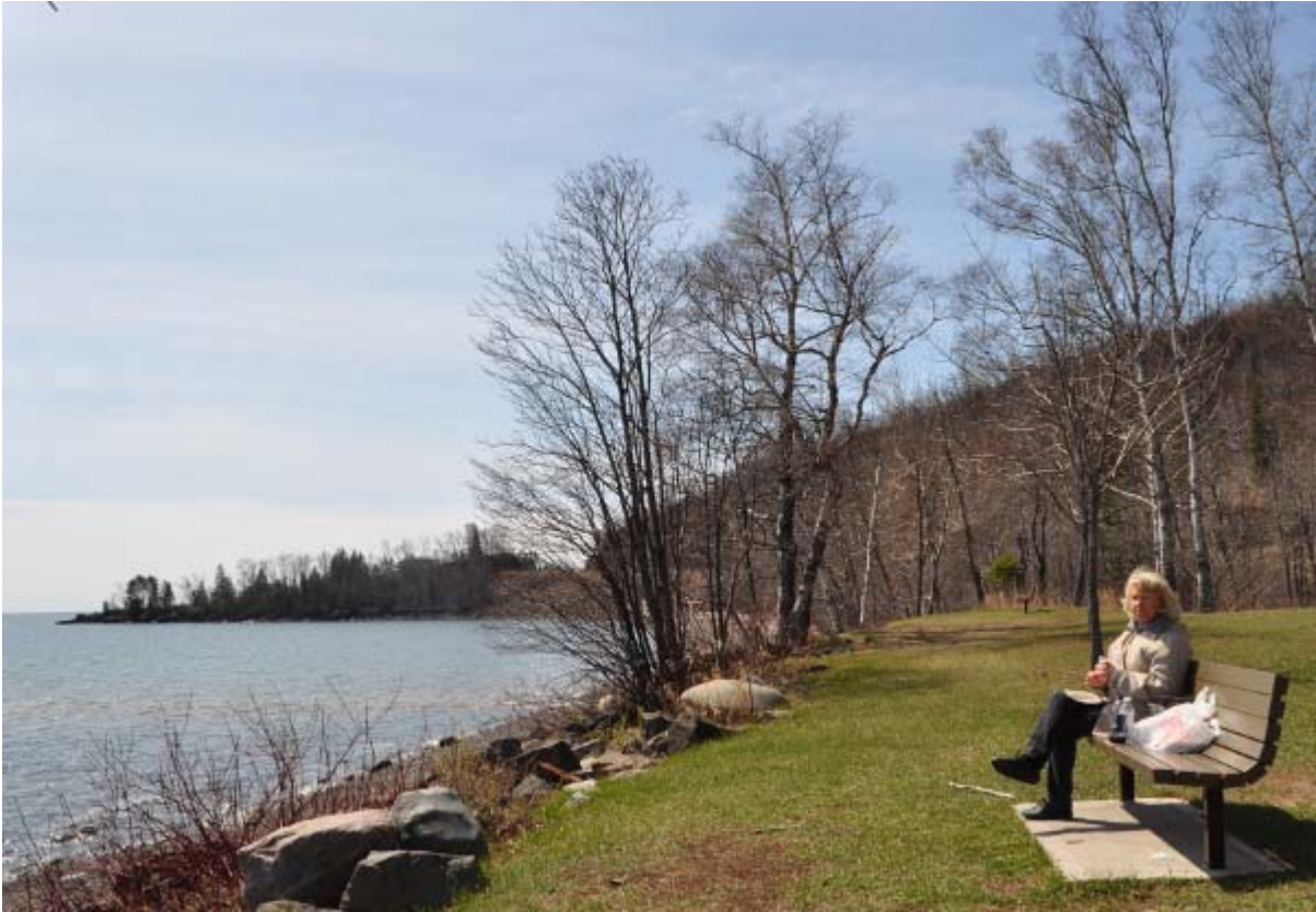
The spring had returned on the way back. Here a picnic lunch at the shore of Lake Superior