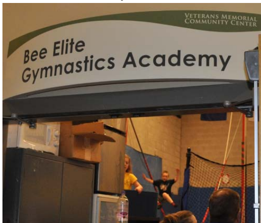
The children showed their skill and it was fascinating to see what they could do and how happy they were.