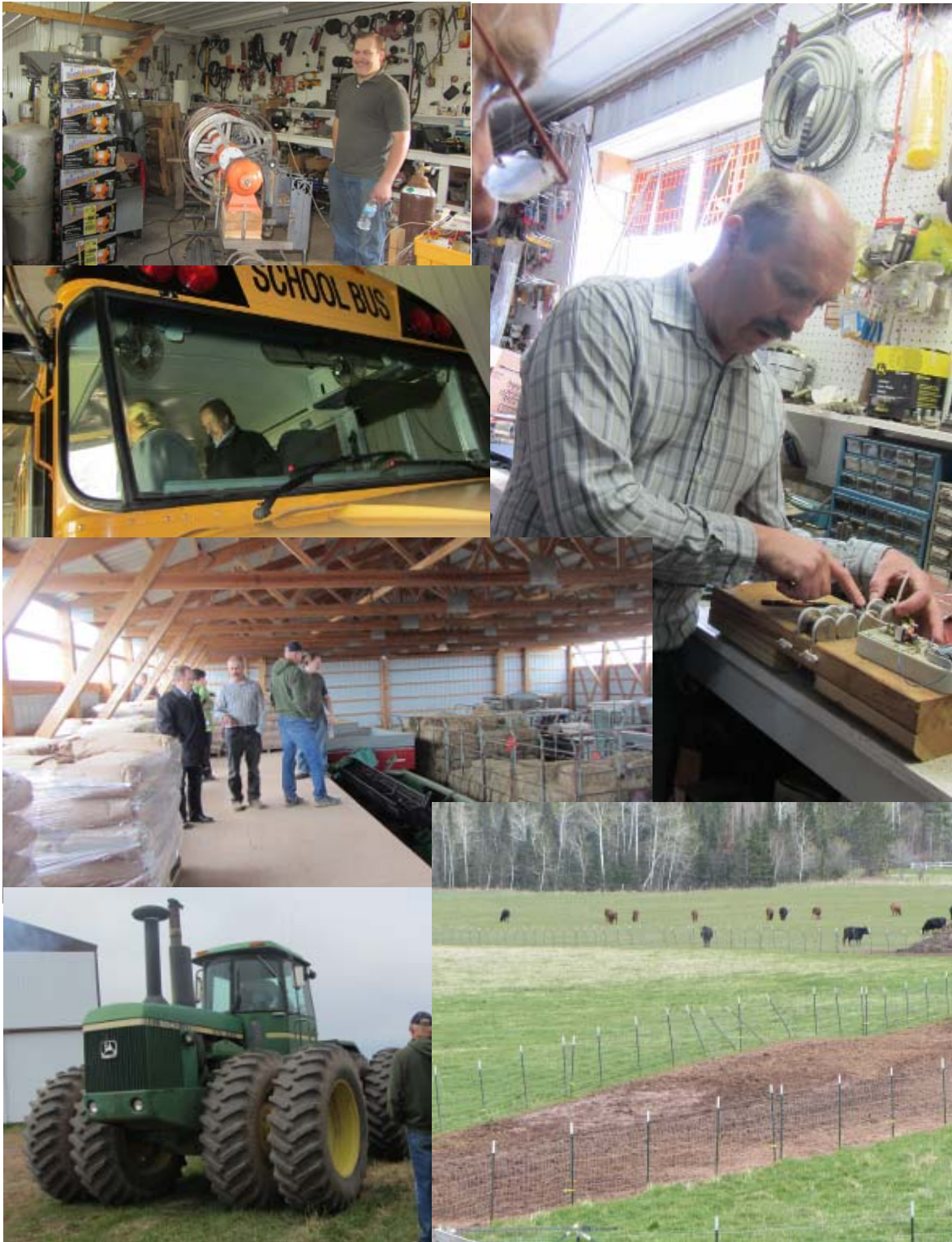
A multitasking and creative inventing family