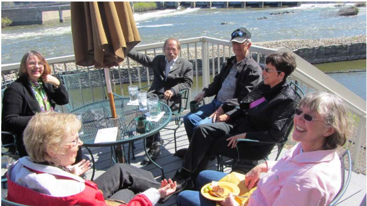
Coffee with cousins at Altas Mill by Fox River in Appleton