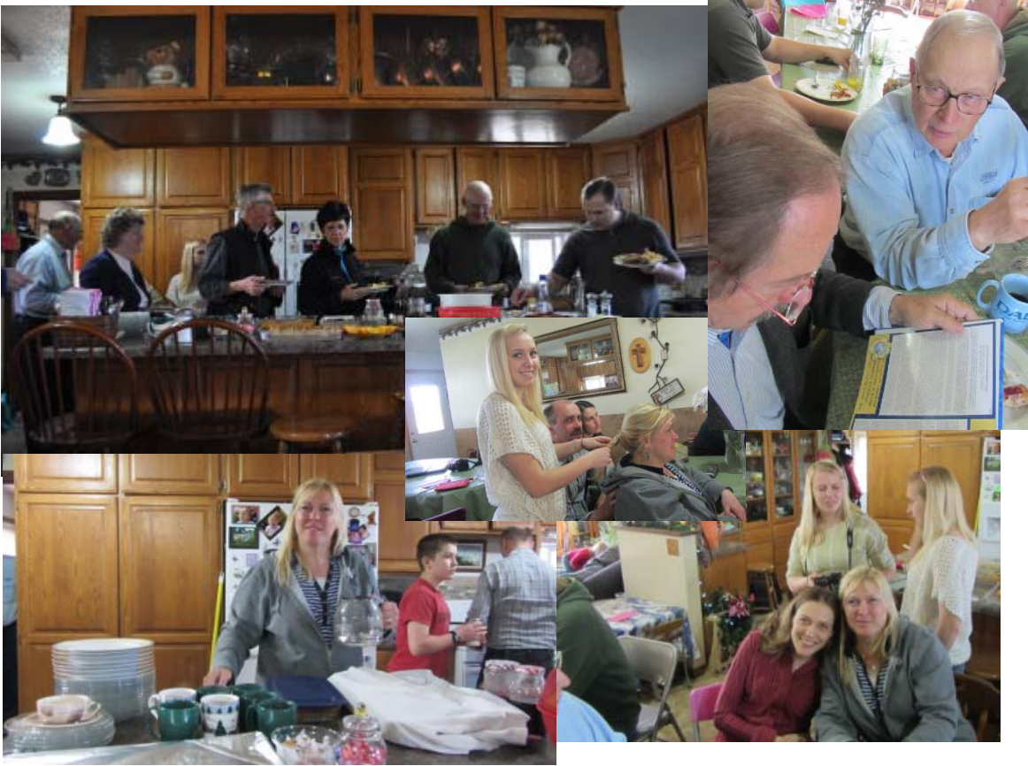
Write things here