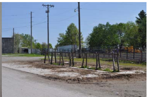
Parking place for horses

In the store we talked with a man about telephones that are not allowed but cell phones are, as they are not connected with cables