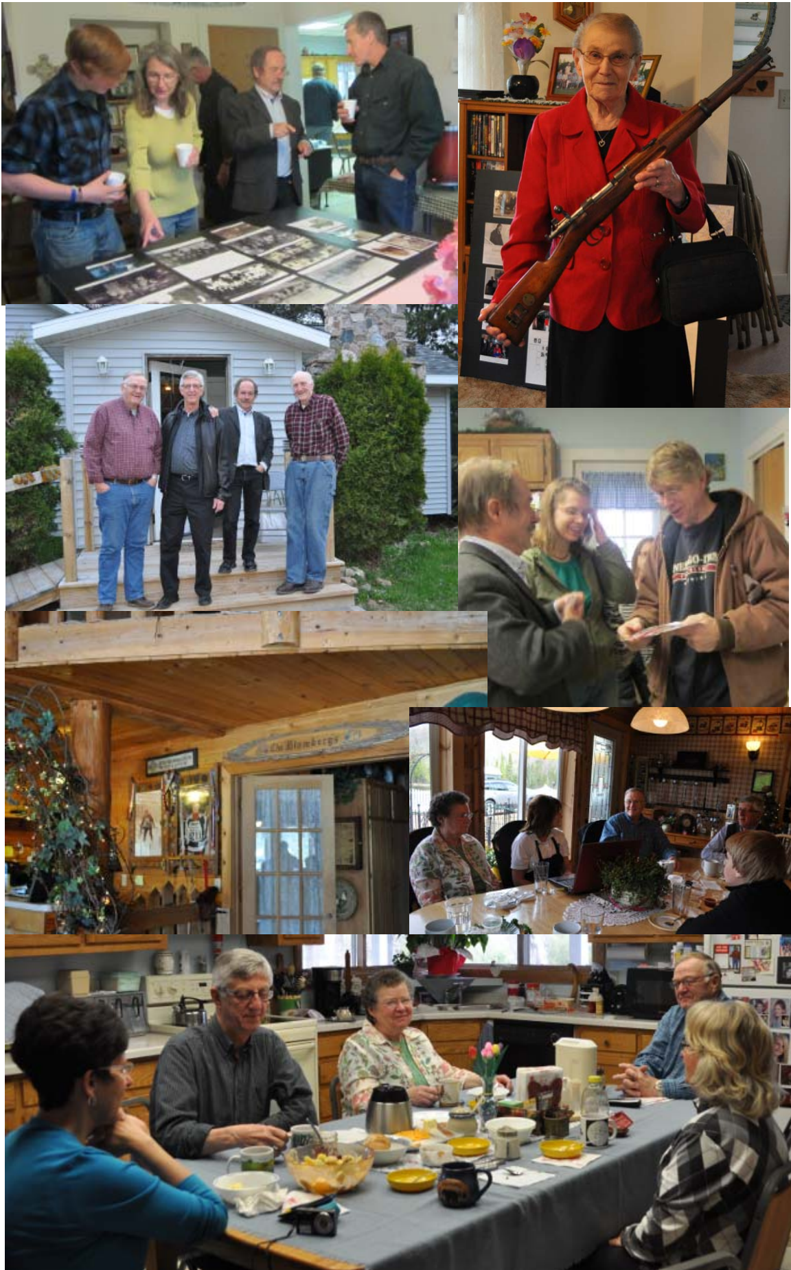
We met a lot of people at the homestead and around. A list here???