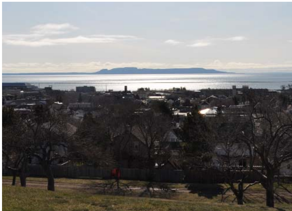
Leaving Canada back to USA we said goodbye to the Giant of Thunder Bay