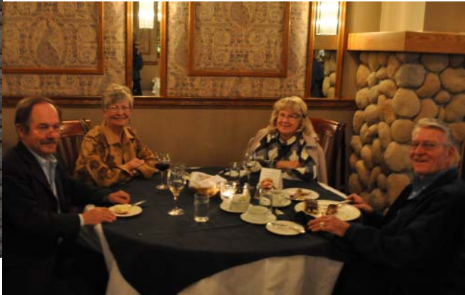
Far well party