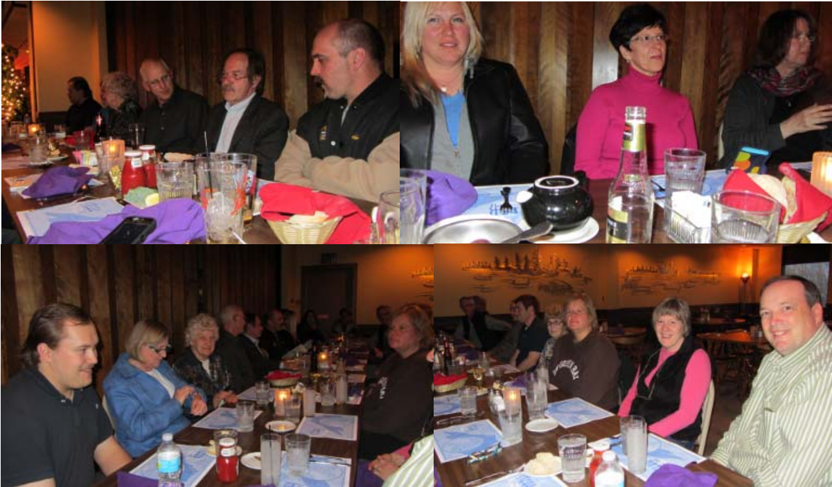
We had a great party at????