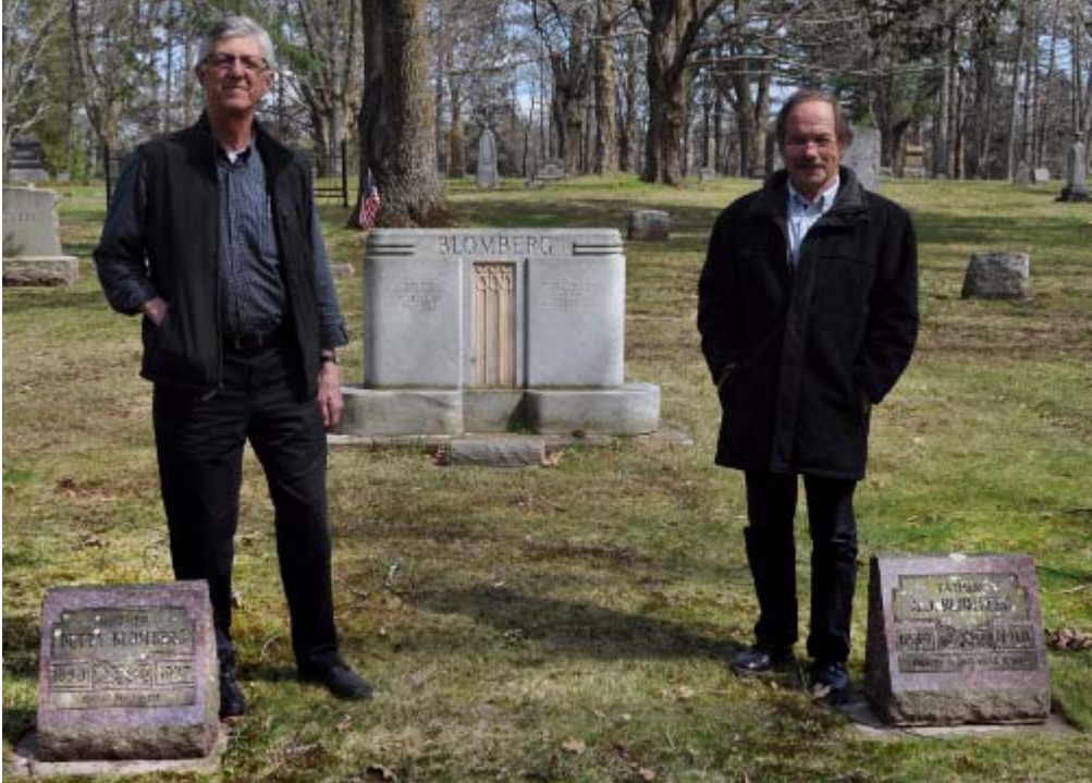
The Blomberg family grave.