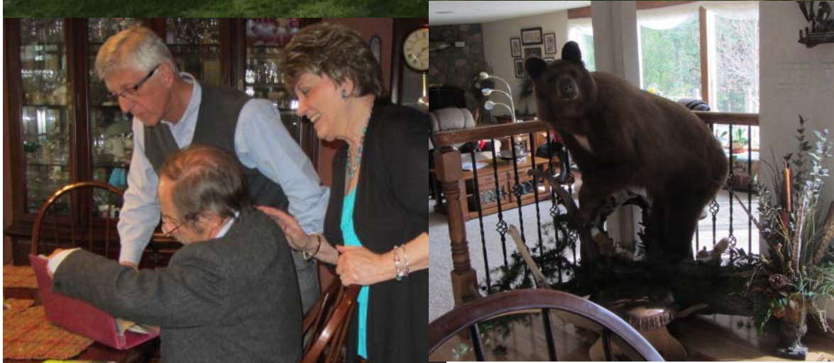
Here some text